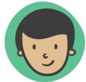
Lenny the Learner

Padstow Park will be moving to the next phase of our PBL next week with the introduction of Rules and Expectations for The Cola (Silver Seats). Set out above are the rules and expectations.